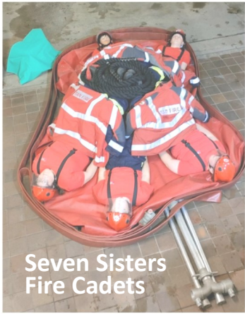
Seven Sisters Fire Cadets