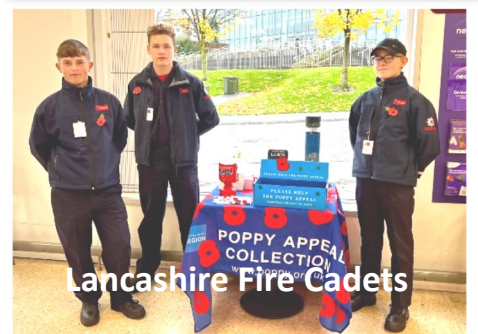
Lancashire Fire Cadets