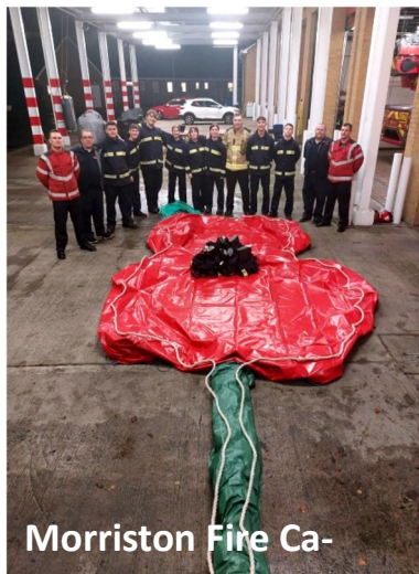
Morrison Fire Ca-