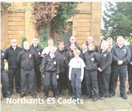
Northants ES Cadets