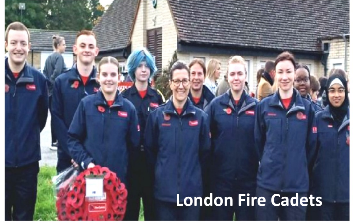
London Fire Cadets