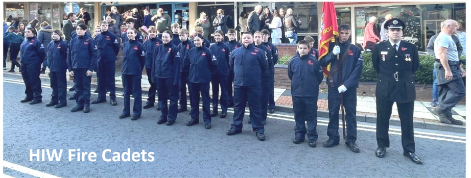
HIW Fire Cadets