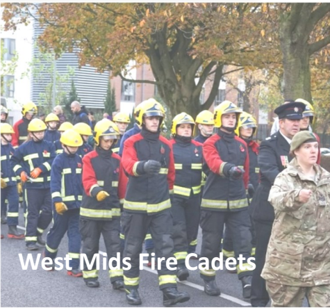
West Mids Fire Cadets