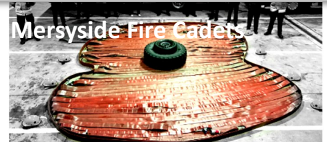
Mersyside Fire Cadets