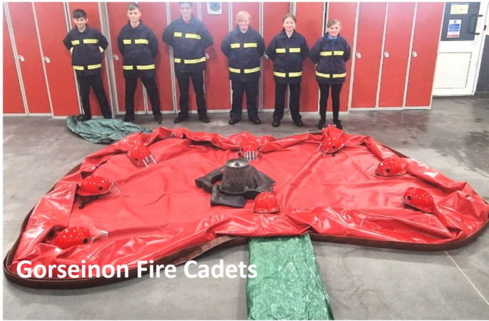
Gorseinon Fire Cadets