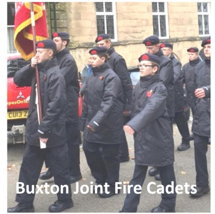
Buxton Joint Fire Cadets