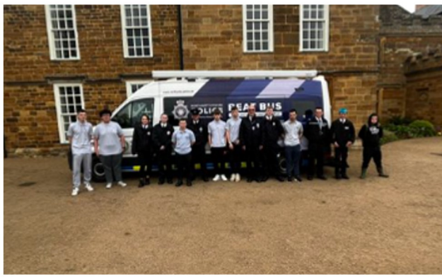
Northampton Emergency Service Cadets volunteering at the #BigHelpOut along with Groundwork UK at Delapre Abbey.