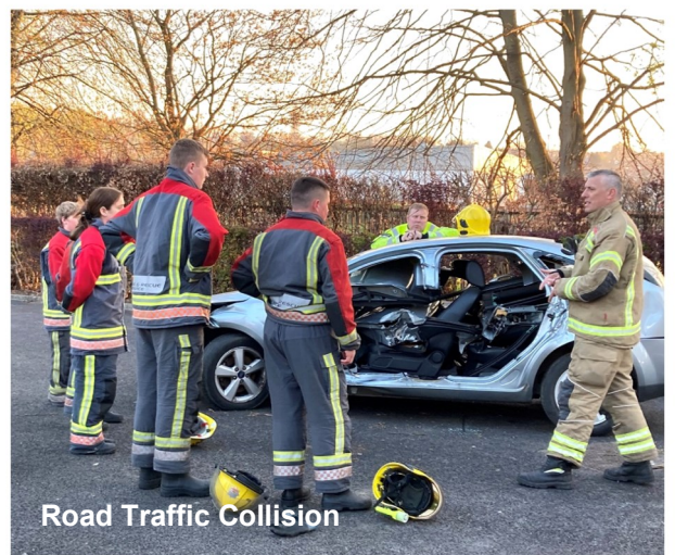
Road Traffic Collision

If you would like to keep up to speed with what our Fire Cadets are doing across the UK, you can follow UK Fire Cadets on @UKFireCadets @ukfirecadets @UKFireCadetsFB , and on our website at ukfirecadets.org.uk . You can also email us at ukfirecadets@nationalfirechiefs.org.uk