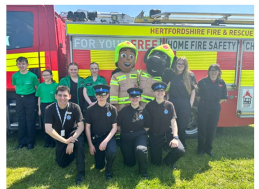
Hertfordshire Fire Cadets worked alongside St John's and Volunteer Police Cadets at the Hertfordshire County Show.