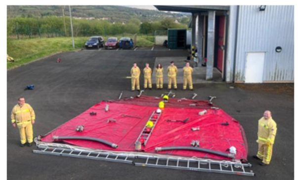
Amman Valley Fire Cadets using their fire kit to create a crown fit for a King.