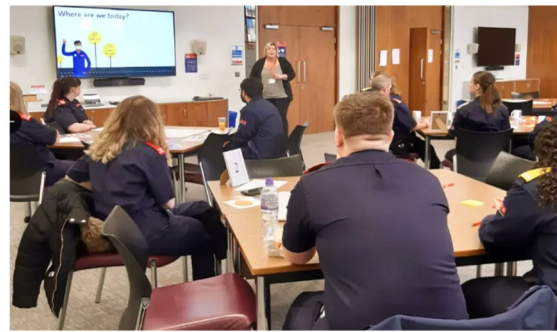
London Fire Brigade's Officer Cadets and Volunteers came together to consult on the development of their Volunteer Strategy, demonstrating the power of active participation