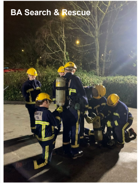
BA Search & Rescue