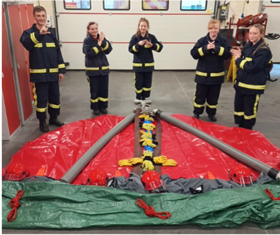
Gorseinon Fire Cadets creating a fire kit crown fit for a King, and learning to sign during Deaf Awareness Week.