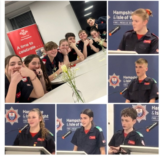
HIW FRS Cadets and staff held an event to recognise and thank all of the amazing work that is done by their volunteers.